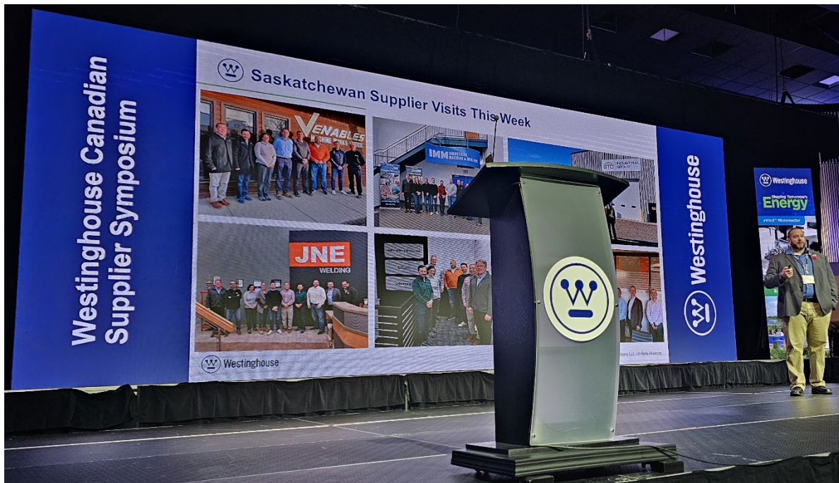
Shop tours of SIMSA members

Sean covered how to work with Westinghouse, how they buy things, things they need, and the like. He also highlighted the shop tours Westinghouse conducted earlier in the week.