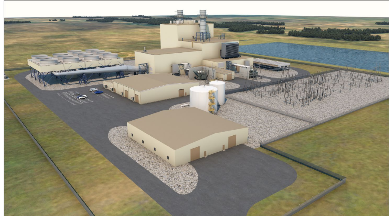
Rendering: Aspen Power Station