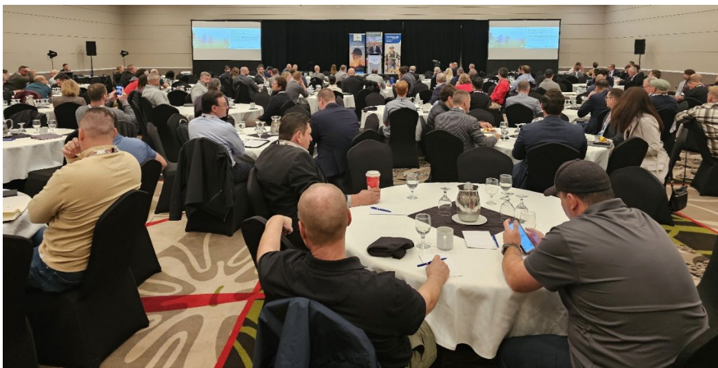
2025 Saskatchewan Suppliers Energy Forum

The 11 th Annual Saskatchewan Suppliers Energy Forum (SSEF 2025) was a bustling event, with major buyers connecting with Saskatchewan's energy sector's supply chain. The event was held on October 8, 2025 in Regina at the Delta Hotel. It is presented by SIMSA and the Saskatchewan Ministry of Trade and Export Development (TED). With more optimism for the sector's future in the air, the event was reinvigorated with over 300 people attending the SSEF 2025; where major energy sector buyers presented on their procurement needs and plans for the coming year, to the Saskatchewan supply chain.