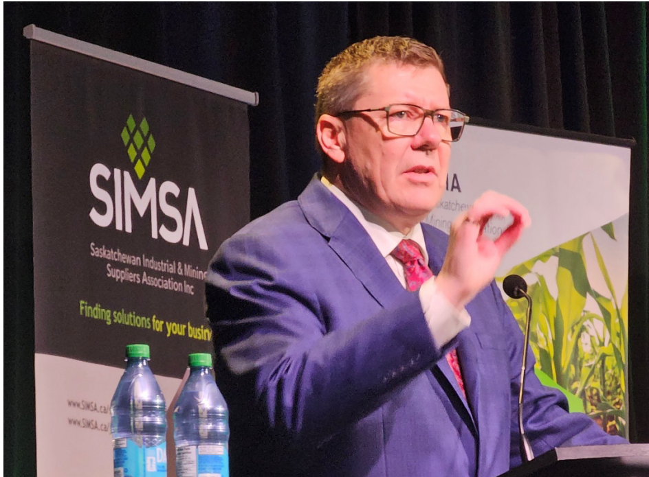
Premier Scott Moe