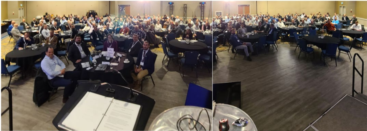
The attending group

Over 200 SIMSA members met with BHP and Hatch/Bantrel JV persons at SIMSA's "Supply to BHP" event on November 17. This was an in-person event on the Jansen potash project and procurement and included presentations, Q&A, and networking opportunities.