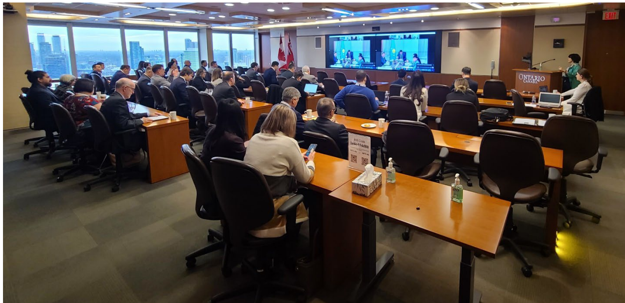
Saskatchewan and Kazakhstani persons meet in-person and virtually to discuss potash.

Finally, the opening of a new potash basin will allow a growing world to be continually fed, as fertilizer (of which potash is one of three types) is directly attributable to half of the world's' food production.