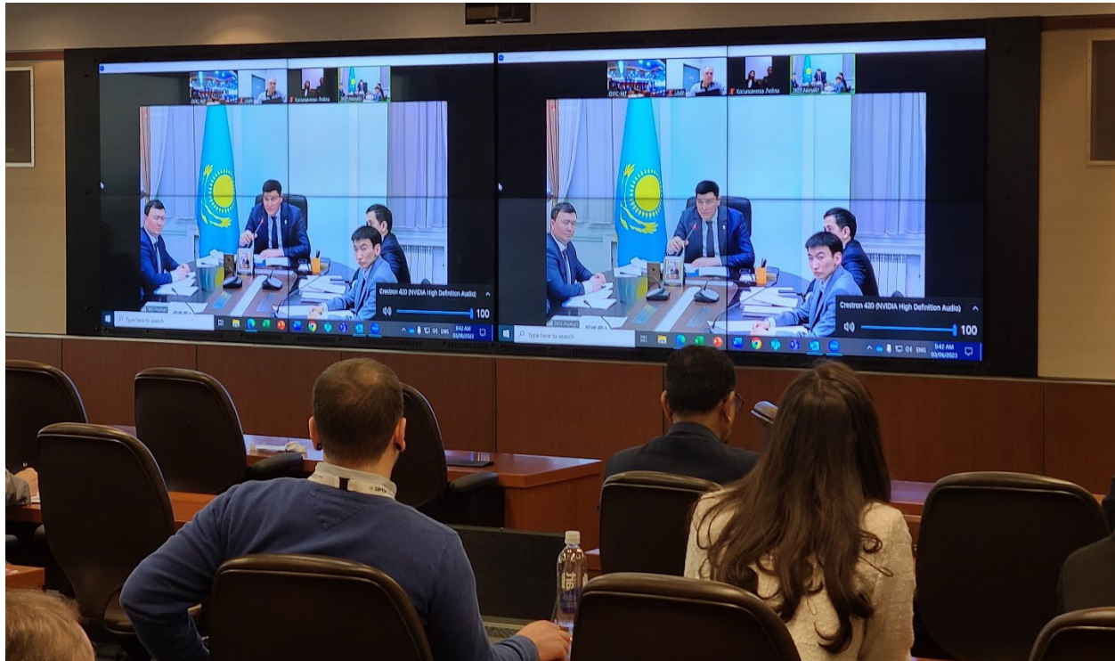
Some of the Kazakhstan Government officials attending virtually.