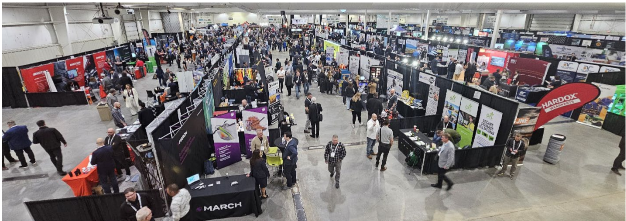
Tradeshow just after opening at 2025 MSCF

The Forum features procurement-related presentations by the province’s key mining and development companies, as well as a procurement panel by mining company persons and a supply chain panel by SIMSA persons.