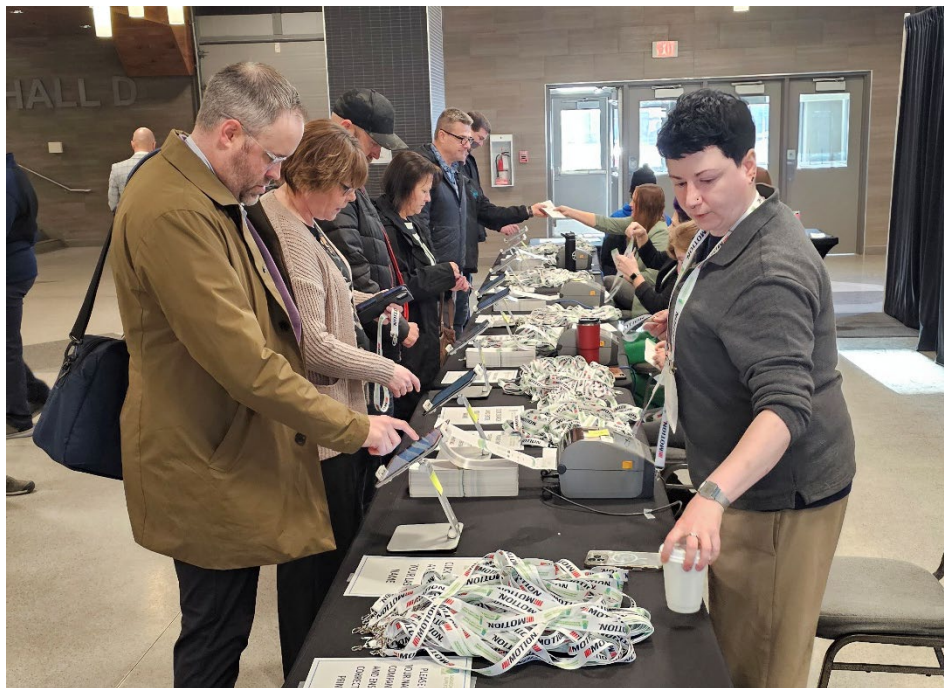
Registration desk at the 2025 MSCF

The event also featured the launch of a new app featuring; self-select tradeshow booth, electronic ticketing, and conference communications.