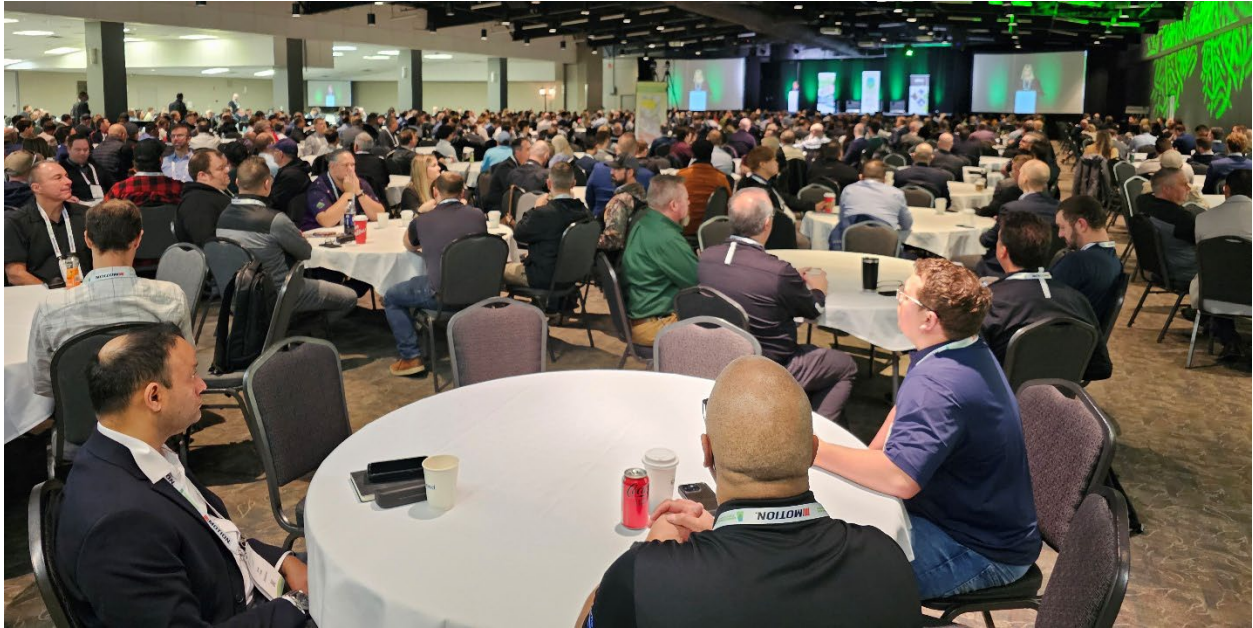
Opening ceremony for the 2025 MSCF

With a record 2,599 registrants including 730 from Saskatchewan mining companies; plus a 380-booth tradeshow that sold-out in 2-weeks; plus a sponsorship program that was awarded by lottery – the double whopper title was well earned.